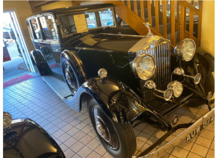
Rolls Royce 20/25