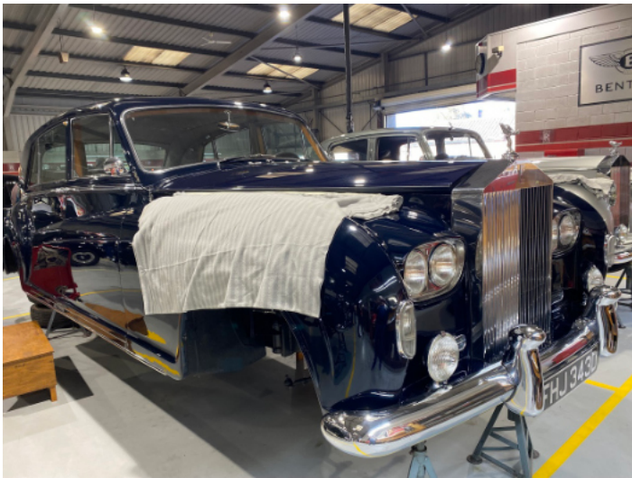
Inside the servicing area