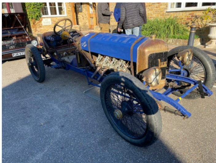
The 'Lux...' racing car

Standouts for me included an odd racing car from the early 20 th century. It had a V8 aircraft engine with exposed valve gear and a name that started with LUX – sadly, I did not get any other detail.