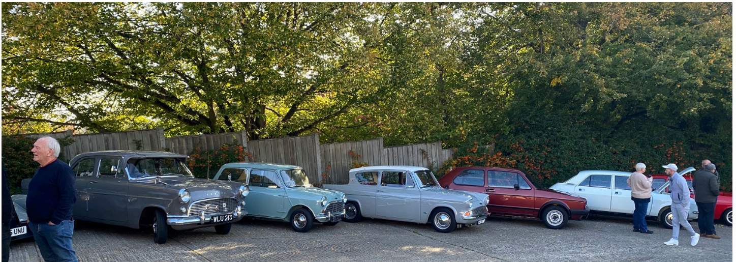
Some of the other classic cars outside ...

... including a Jaguar XK120 coupe and, best of all of course, a familiar white Jaguar 420!