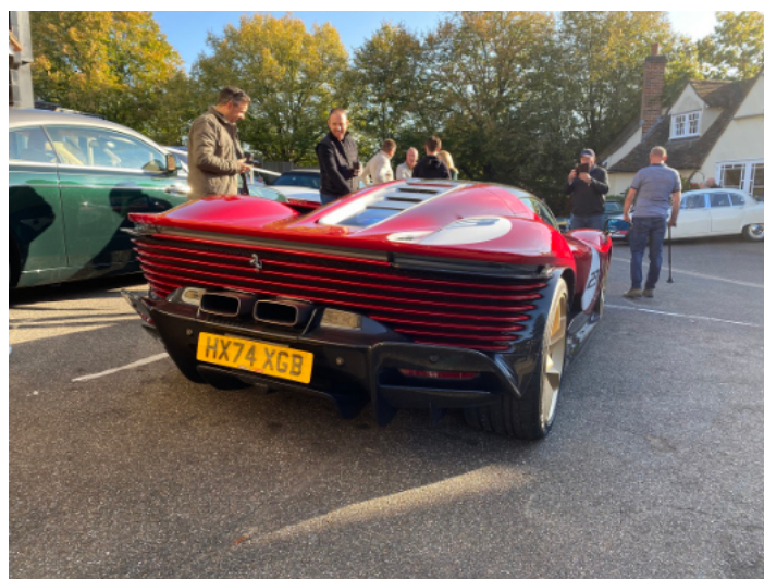
Front and rear views of the 2024 Ferrari Daytona SP3 (but not in a Tesco car park...)