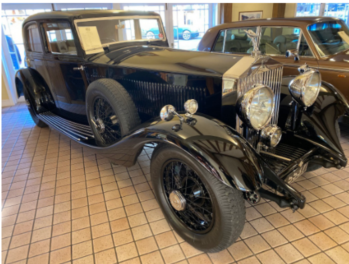
Rolls Royce Phantom II

On the day, all departments were open to us and we were able to walk into the two-storey, carpeted showroom to inspect its contents. Amongst many enticing cars for sale was a 1932 Phantom II Continental with a mere 95,000 miles on the odometer – yours for £245,000, but it did come with its original factory tool kit. Adjacent to it stood a 1933 20/25, selling for a mere £77,500. It seemed like a large difference to me for such a similar car, but I'm sure the RR buffs amongst you could explain the reason. The rest of the cars consisted of models from most decades to even the latest electric Rolls. I did like the convertible Corniches, still my favourite.