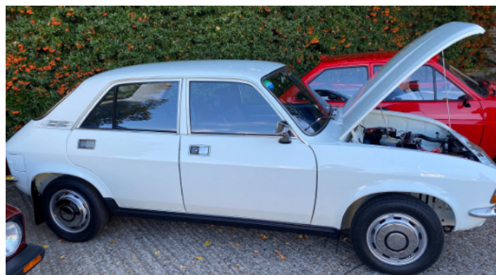
1976 Austin Allegro 1100 deluxe