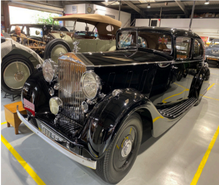
Monty's Rolls Royce