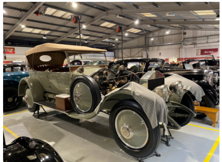
Inside the workshop at P&A Wood