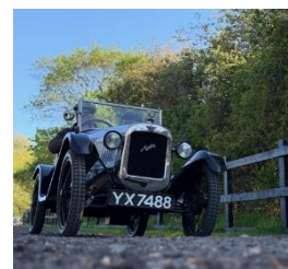
A few late comers arrive

Suitably fed and watered we were called to our cars